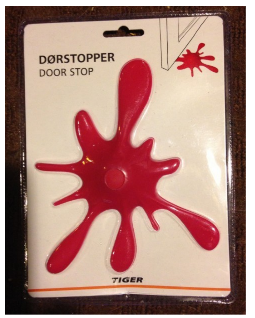
For the unhinged door-opener: a splatty-looking doorstop, this week's second prize.

In <u>Week 1180</u> we invited you to choose any comic strip or panel that appeared in The Post, in print or online, over a 12-day period, and either (a) add or replace a line of dialogue or (b) provide a question that a line in the comic could answer (it didn't have to be said to the character in the strip). The links below on the comics' names show you the original strips.